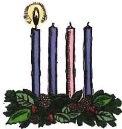
First Sunday in Advent