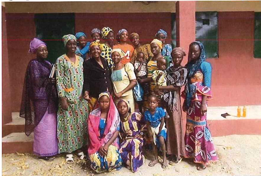
Some of the Deaf women at LCCN Deaf Church, Jimeta, Nigeria

Donations above the visa costs will be given to LCCN. A short program will follow dinner... RSVP to 1991CTK@gmail.com